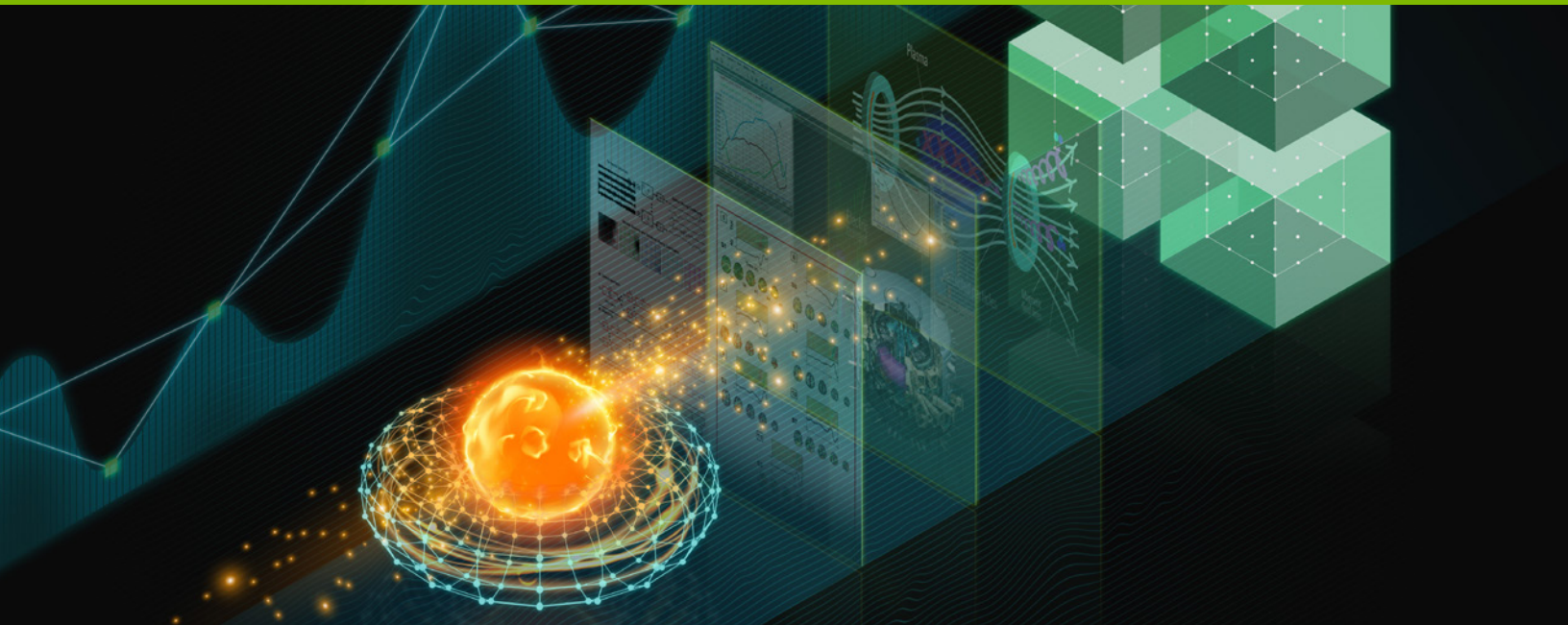
Stylized illustration of a Tokamak generating clean energy powered by nuclear fusion